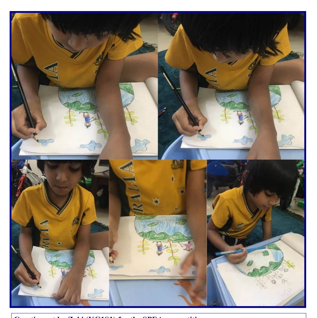
Creative art by Zaki (KG1S1) for the SPEA competition